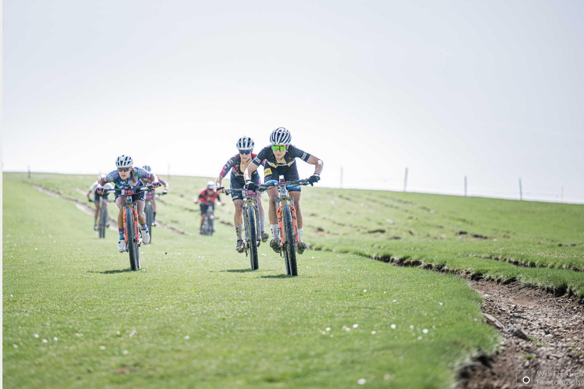
A section of the NaturLand 2025 during the women's race descent through the meadows of the Sant Julià de Lòria plateau.