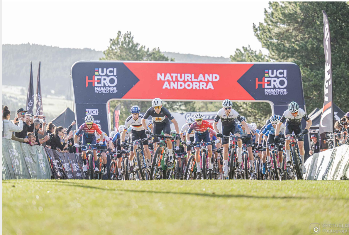
The start of Naturland Andorra, valid as the second round of the 2025 HERO UCI Cross-country Marathon World Cup

There were over 100 cyclists competing in the UCI World Cup representing 20 countries, racing across an extremely technical track boasting 60 km and 1,984 hm. Besides the technical track, the altitude of 2,000 m also had an impact on the race.